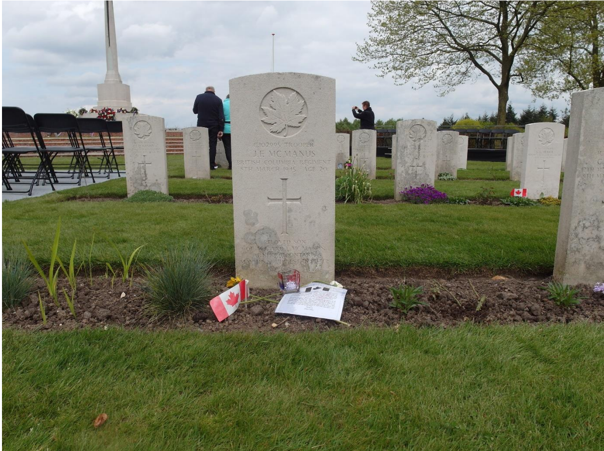
Faces to Graves – cemetery find May 4, 2015.